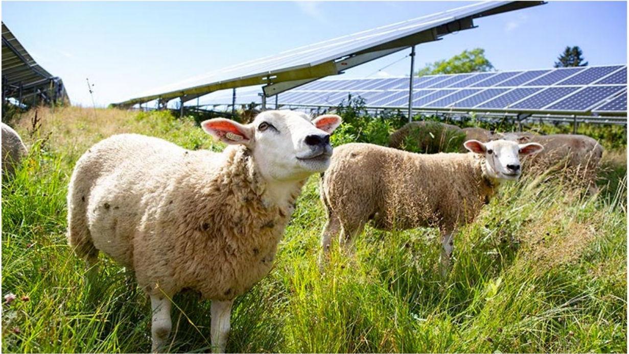
Solar arrays can make a great home for grazing livestock, with the panels offering shade and shelter to the animals, who in turn keep the vegetation under the panels trimmed.